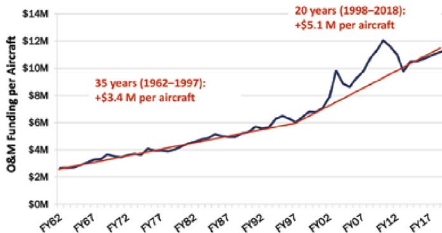
Figure 1: Trends in O&M funding per aircraft (Gunzinger et al., 2019)

Sustainment costs for USAF weapon systems, especially legacy systems, are untenable. Eckbreth et al., (2011) also tied the challenges to the sustainment enterprise to supply chains that are inefficient due to the inability to accurately predict parts needs. In 2011, they claim the demand forecast for spare part was only 19% accurate. Furthermore, the USAF expenditures to operate and maintain the active fleet ballooned to $63.7 billion in 2019 dollars. Part of the growth in sustainment expenses were due to the age of the fleet (Gunzinger, et al., 2019). Figure 1 shows the upward trend of operation and maintenance costs per aircraft across all fleets.